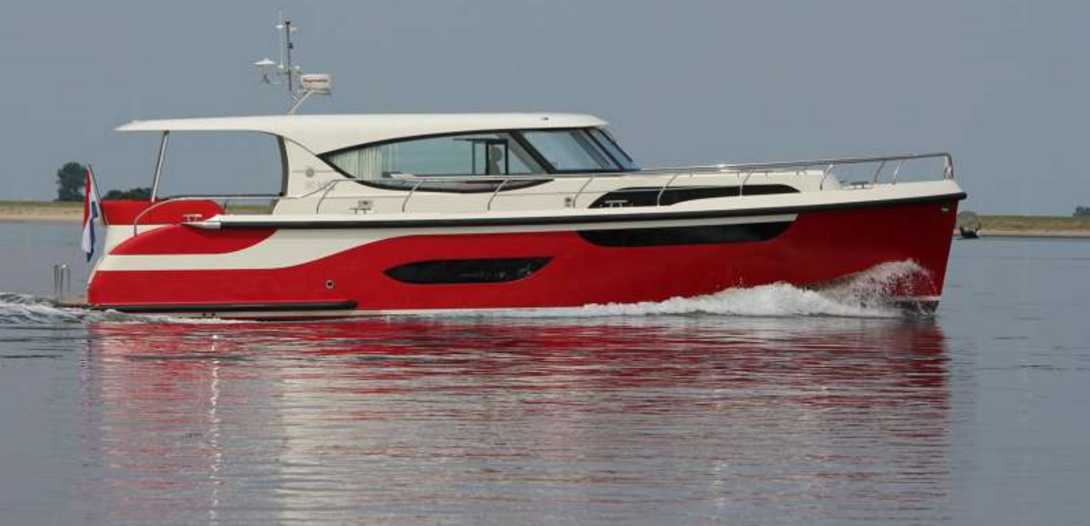
JETTEN 50 MPC