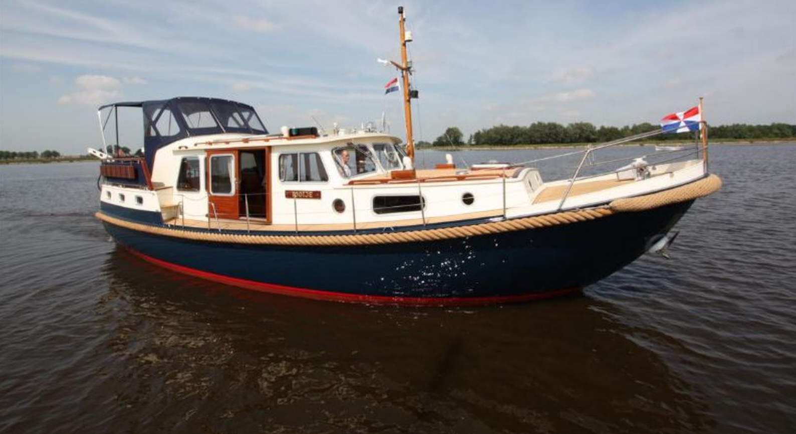
VALKVLET 12.30 BB