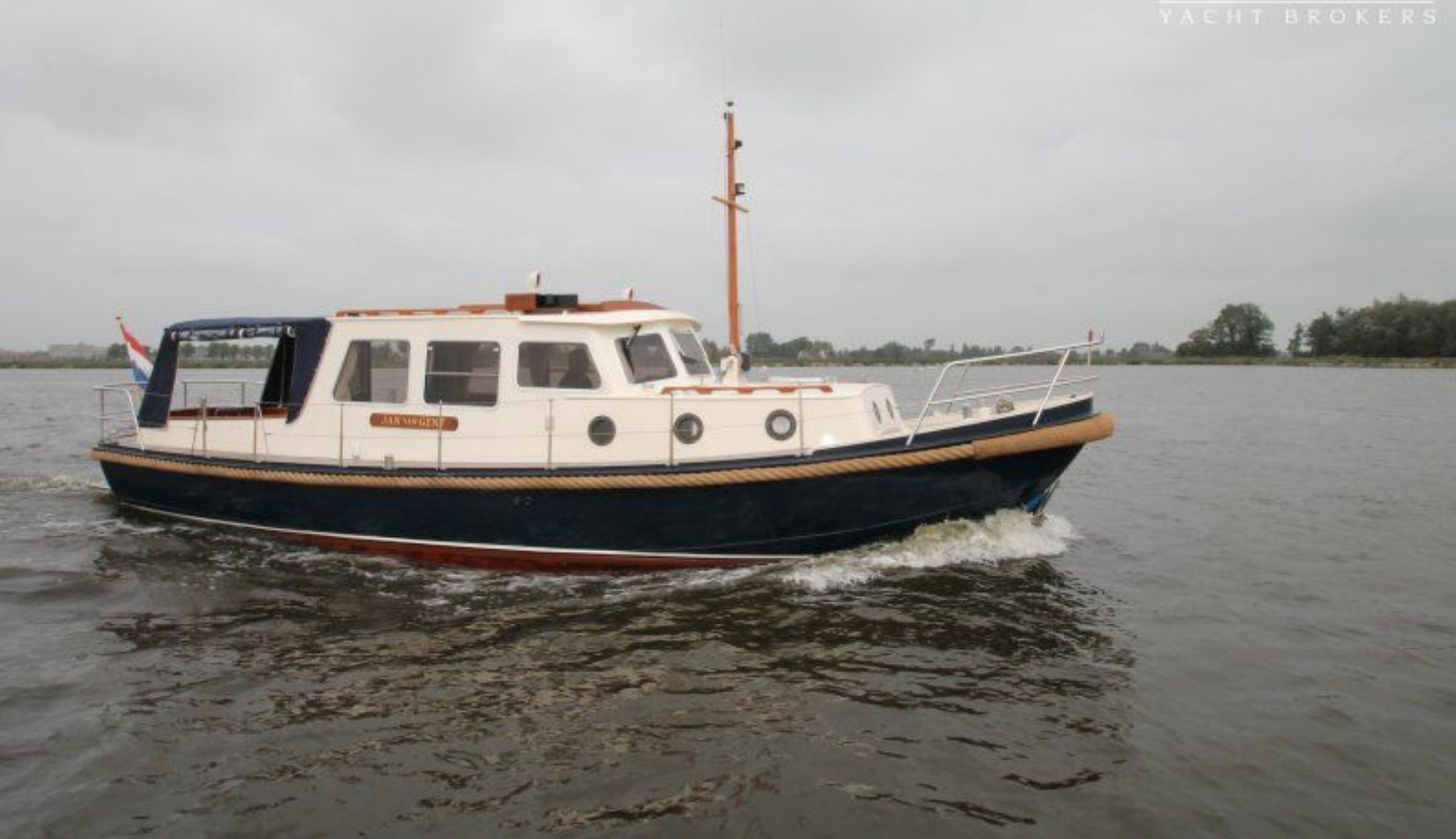
GILLISSENVLET 10,40 OK