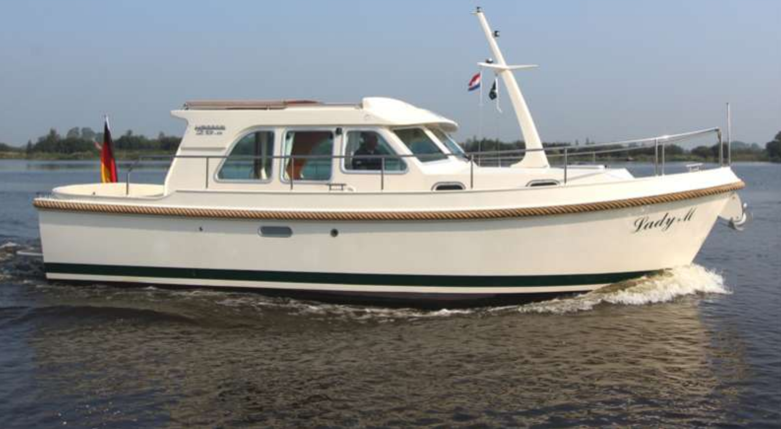
LINSSEN 29.9 SEDAN