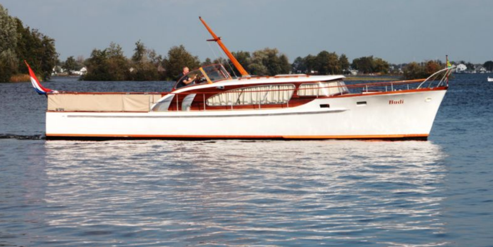
VAN LENT 1430