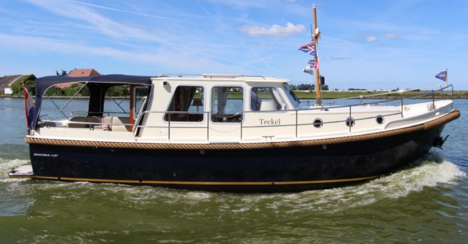
BRANDSMA VLET 1000 OK