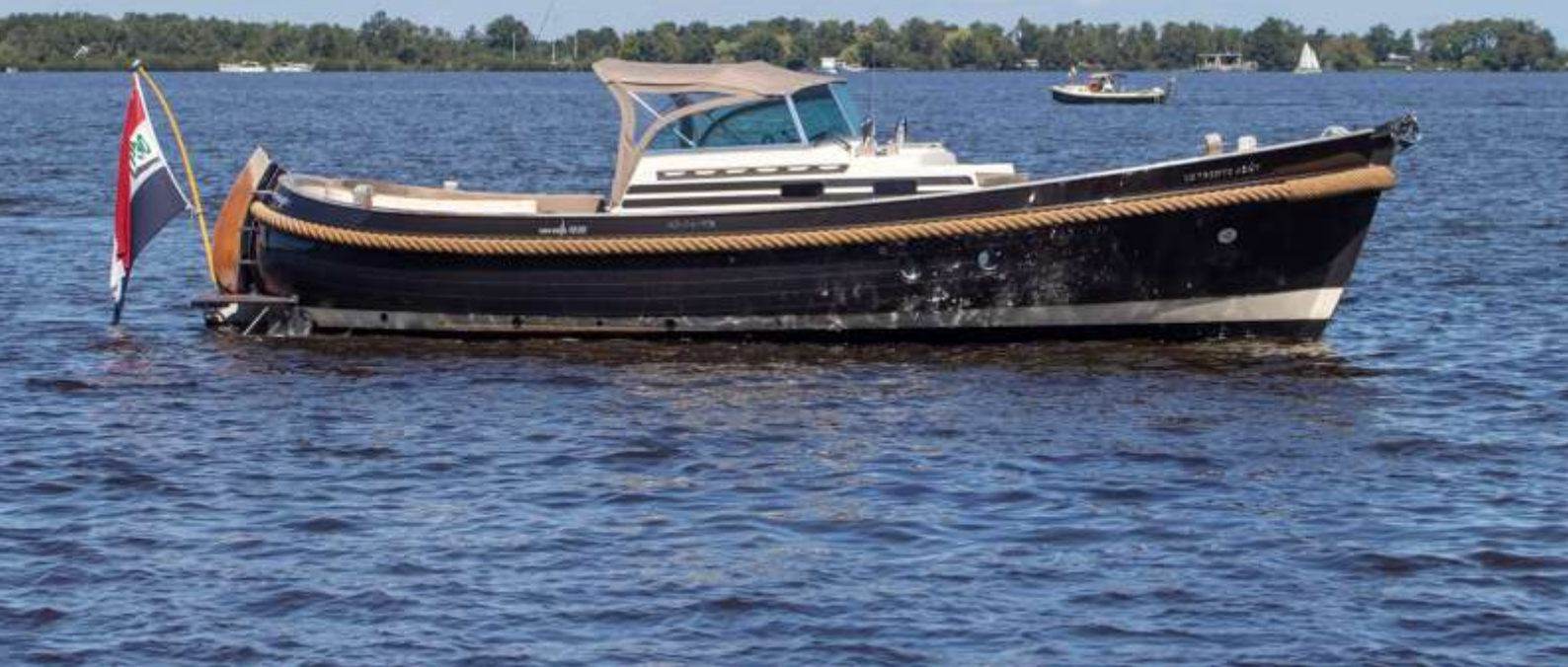
VAN WIJK 1030