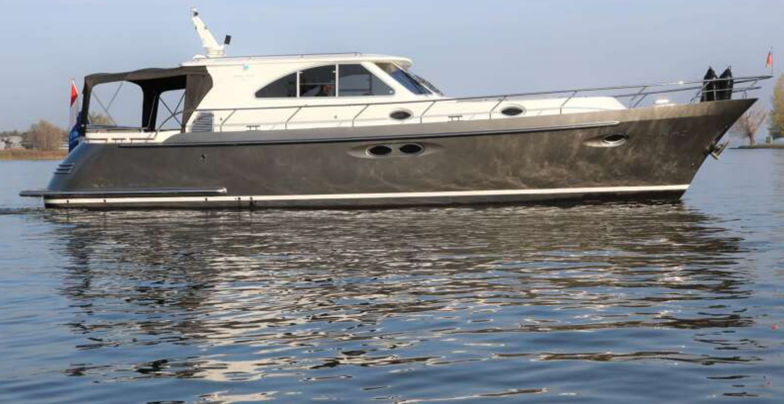
THOMASZ TRISTAN 50 HT BUSINESSCLASS