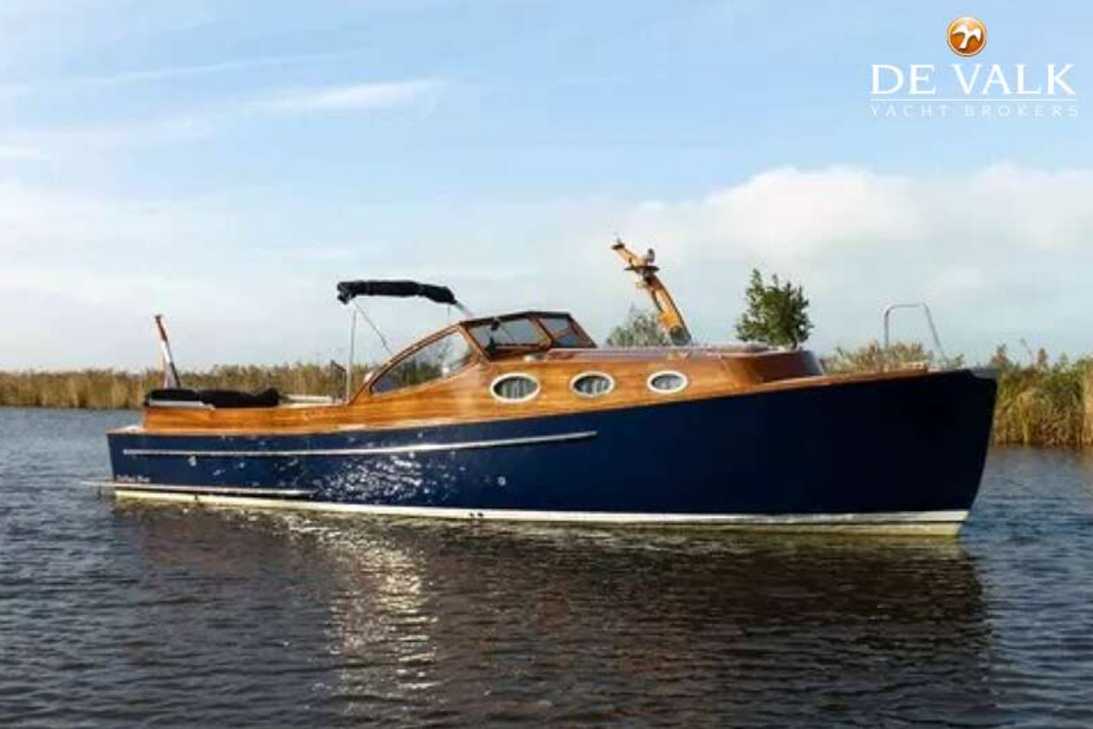
DA VINCI 29